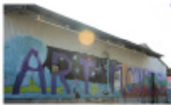
'Art Moves' mural at Railroad Square Art Park